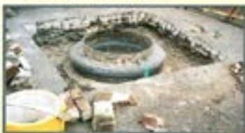
Try our HDPE Rings on your next project!