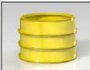
Shields are stackable for increased height